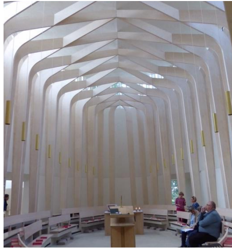
the college chapel