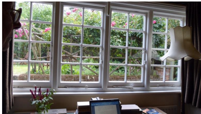
View from CS Lewis' study