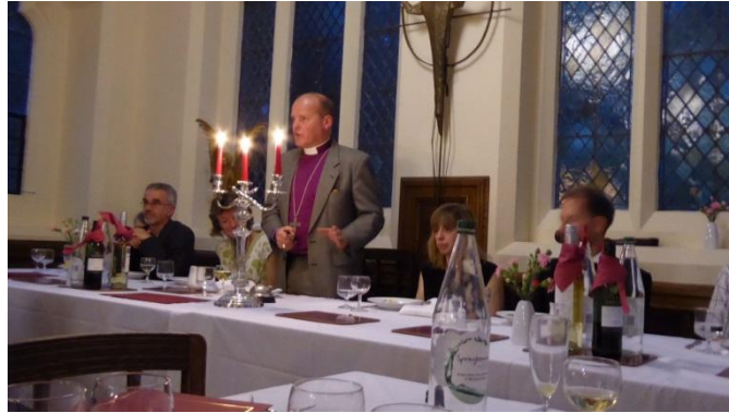
Gala dinner: Principal's speech