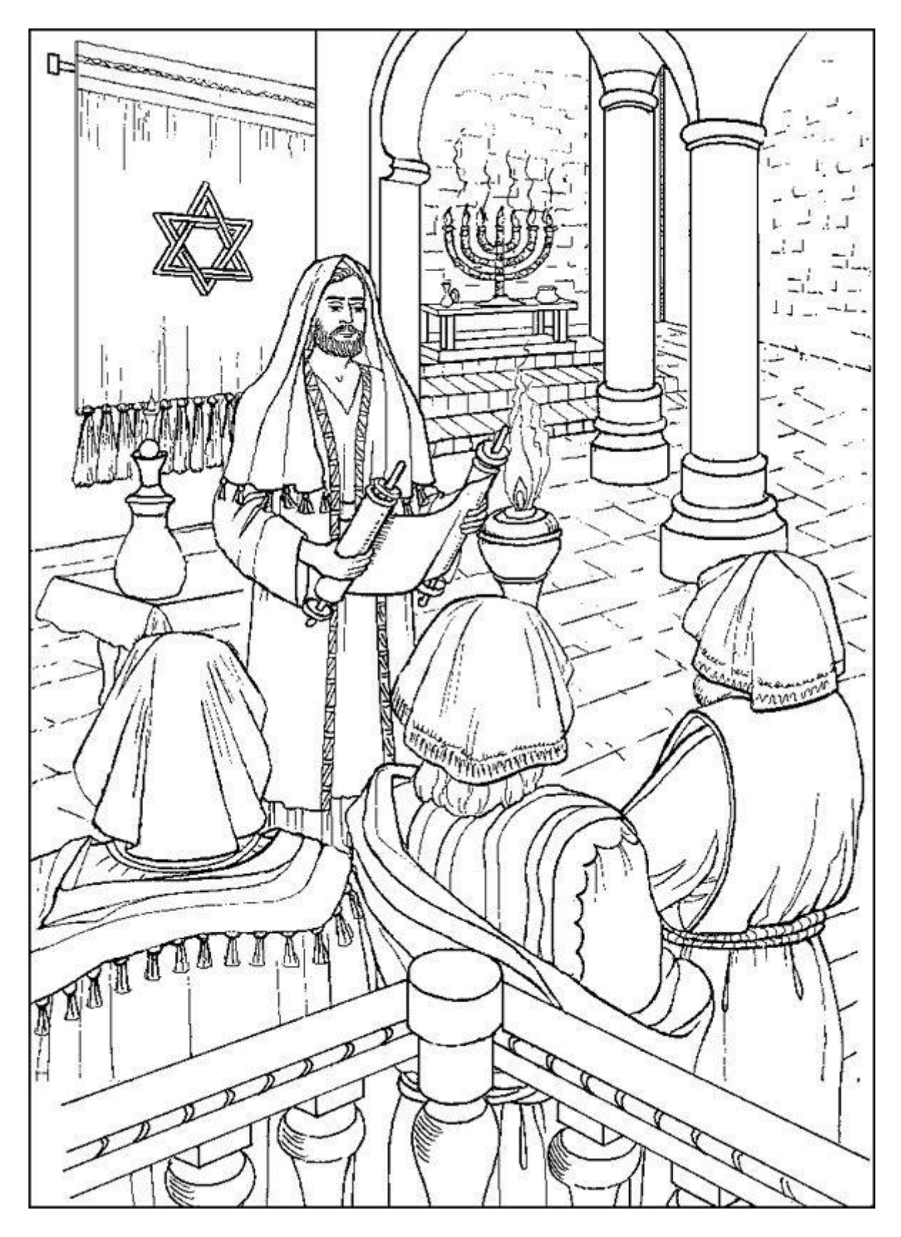
Jesus Teaching in the Synagogue