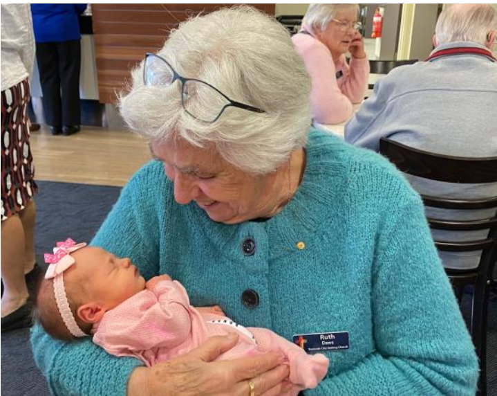
BCUC Youngest member