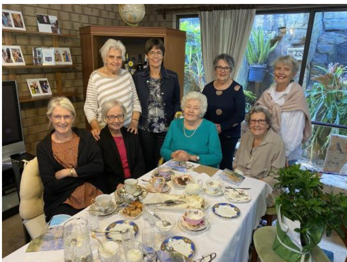
BCUC Table Tennis after 70 years ends