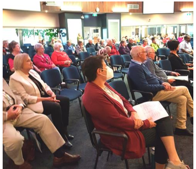
BCUC Sunday Worship