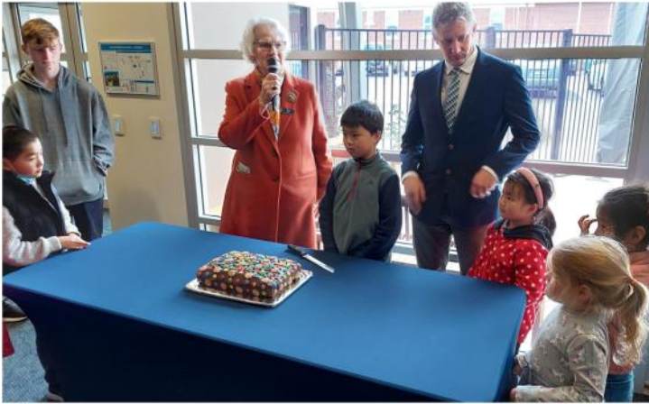
Cutting BCUC Birthday Cake

169 BCUC Online subscribers 1.5k views of BCUC videos in the last month 125 average monthly attendance 199 individuals in the past month 219 weekly email subscribers