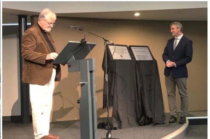
New BCUC Plaques for Playground wall