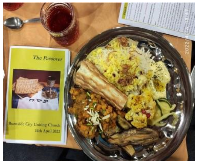
Passover Meal on Maundy Thursday